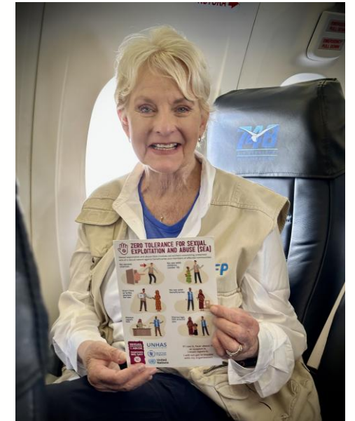
Cindy McCain with campaign material in Kenya (April 2026).