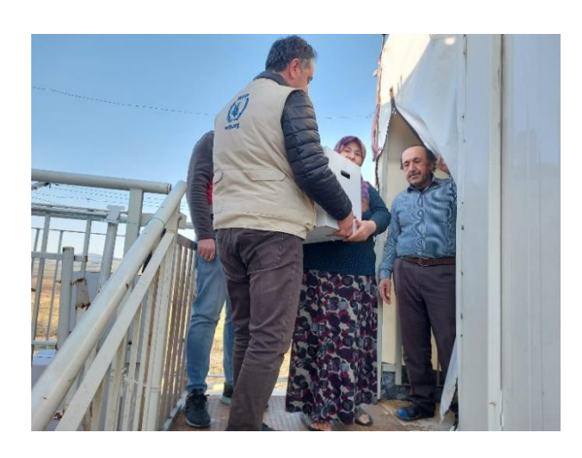
Photo Caption: WFP staff distributing food packages to refugees and IDPs in Cevdetiye camp, Türkiye.