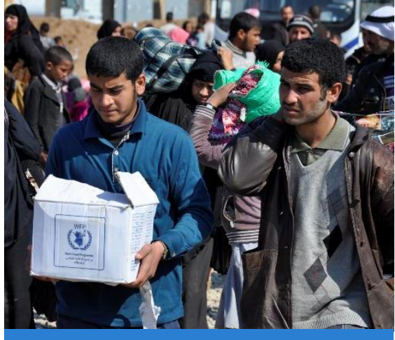
Immediate Response Account