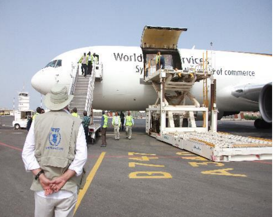
Global Commodity Management Facility