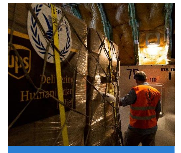
Internal Project Lending and Macro-Advance Financing