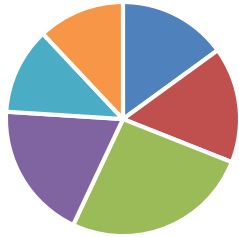
Operation Evaluations (2013-2016)