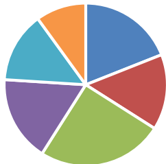
WFP Work Plan (2013-2016)