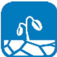
Climate change and resilience