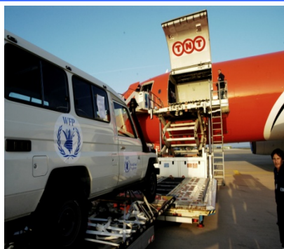
Emergency / Logistics