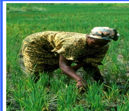
Purchase 4 Progress