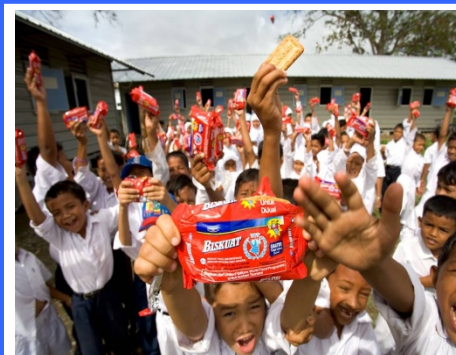
Advocacy & Awareness