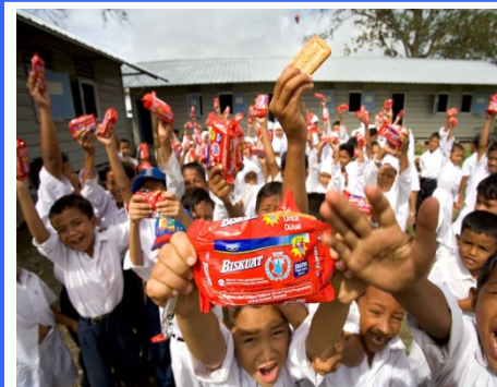
Advocacy & Awareness