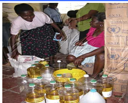
Nutrition / Health & Education