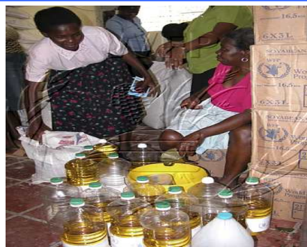
Nutrition / Health & Education