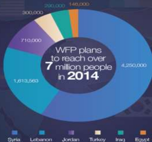
Requirements in 2014