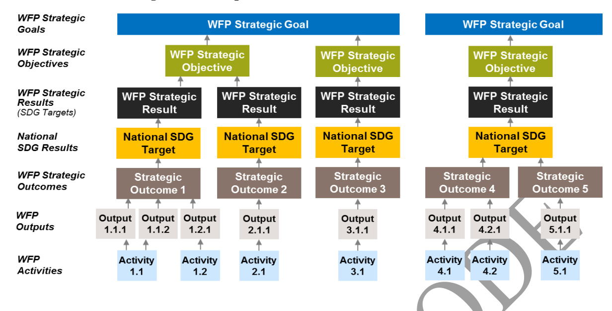
Figure 2: Example of the results chain for a WFP CSP

52.54. The CSP logical frameworks will use outcome indicators from the CRF. WFP country offices retain the flexibility to complement or fill gaps in the CRF with country-specific outcome indicators as required.