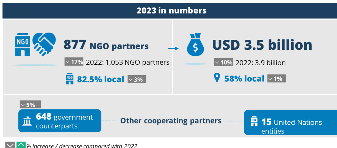
Figure 1: Cooperating partners in numbers, 2023

▼ ▲ % increase / decrease compared with 2022.