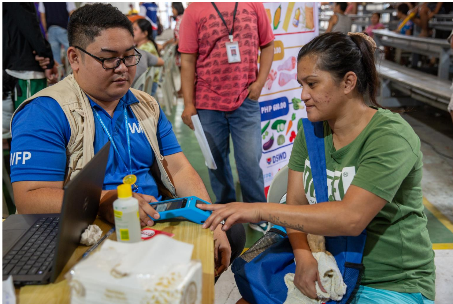
Verification of Walang Gutom (No Hunger) 2027 programme participants in Tondo, Manila on 22 December 2023.