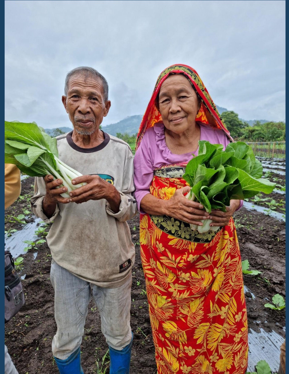
21 February 2022, Matanog, Maguindanao del Norte