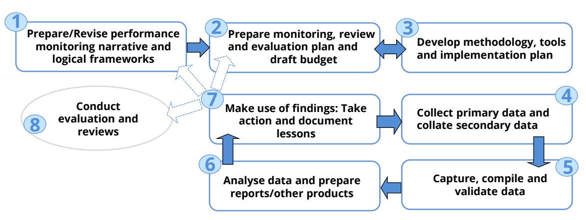
Figure 4: The eight standard process steps of the country strategic plan monitoring cycle