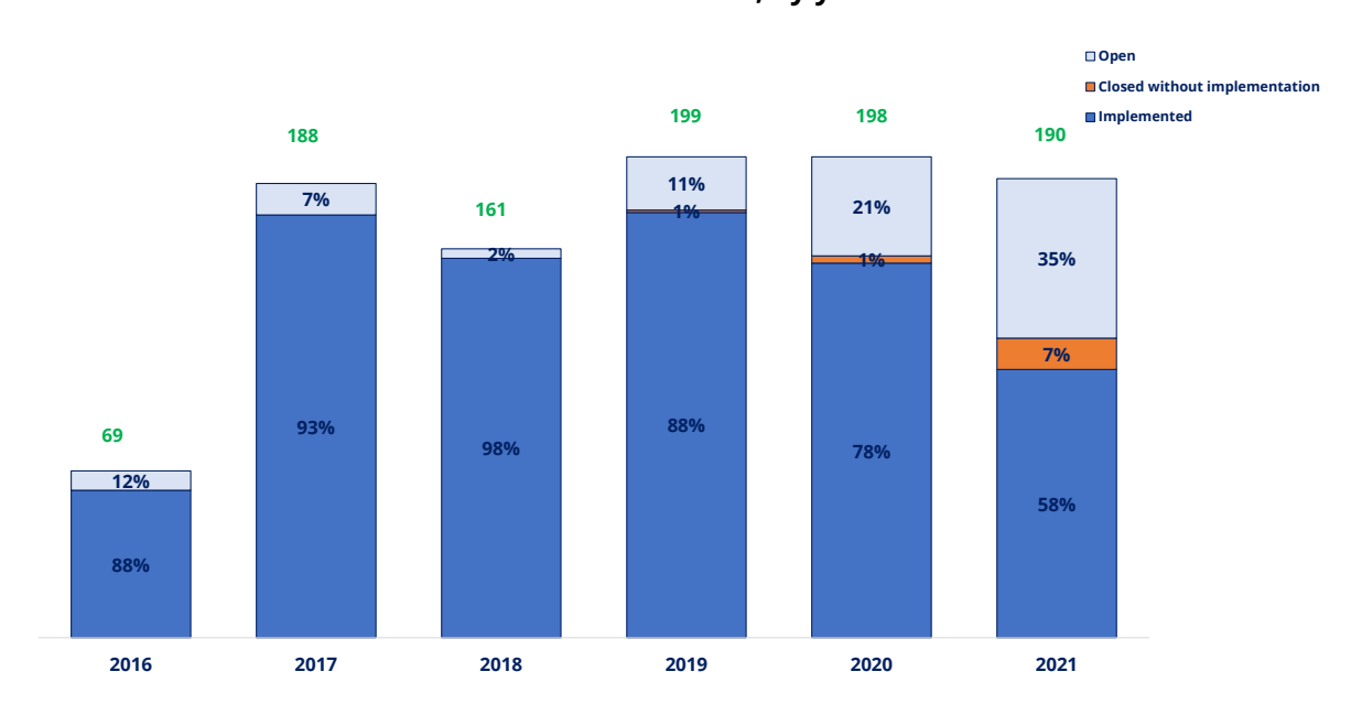
Figure 2: Implementation of recommendations due between 2016 and 2021, by year due