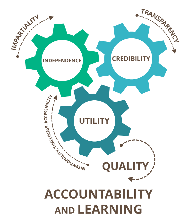
Figure 3 Evaluation principles

24. The WFP evaluation function is based on the UNEG evaluation principles<sup>20</sup> of independence, credibility and utility. Application of these principles ensures evaluation quality, enhancing accountability and learning throughout WFP to improve performance and results.