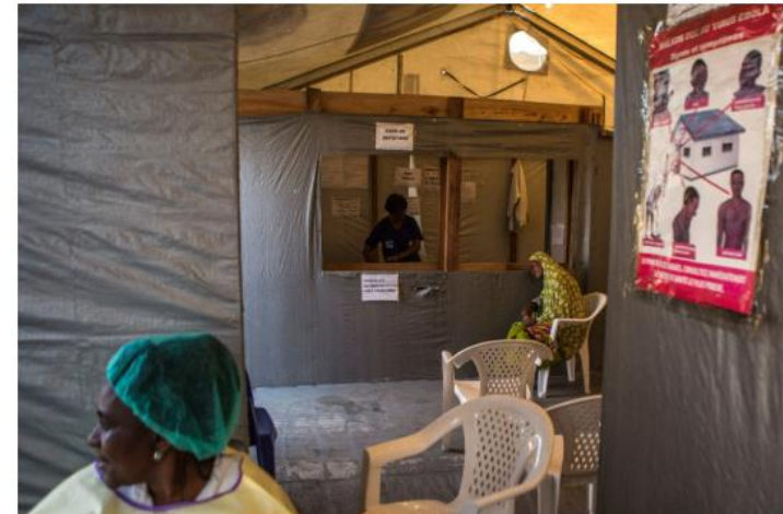
A detection zone for possible Ebola patients at a hospital in Goma, in the eastern part of the Democratic Republic of Congo, in 2019.

The U.N. health agency, already grappling with the challenge of leading the global response to the coronavirus pandemic, vowed it would investigate the allegations that women were exploited in return for jobs.