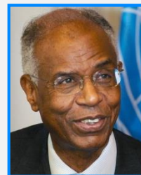
Mauritania: Mr. Ahmedou Ould-Abdellah Former Minister for Foreign Affairs; Former Senior UN Official