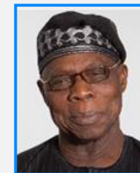
Nigeria: Former President Olusegun Obasanjo