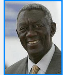
Ghana: Former President John Kufuor