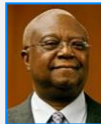
Liberia: Former Interim President Amos C. Sawyer