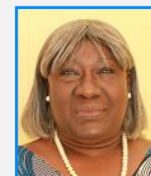
Senegal: Professor Ndioro Ndiaye, Former Minister for Social Development & IOM Deputy ED

Currently being identified: Benin, Cape Verde, Côte d'Ivoire, Guinea Bissau, Niger, Sao Tomé, Sierra Leone, Togo