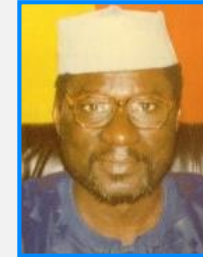
Chad: Former Prime Minister Nassour G. Ouaido