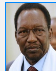
Mali: Former Interim President Dioncounda Traore