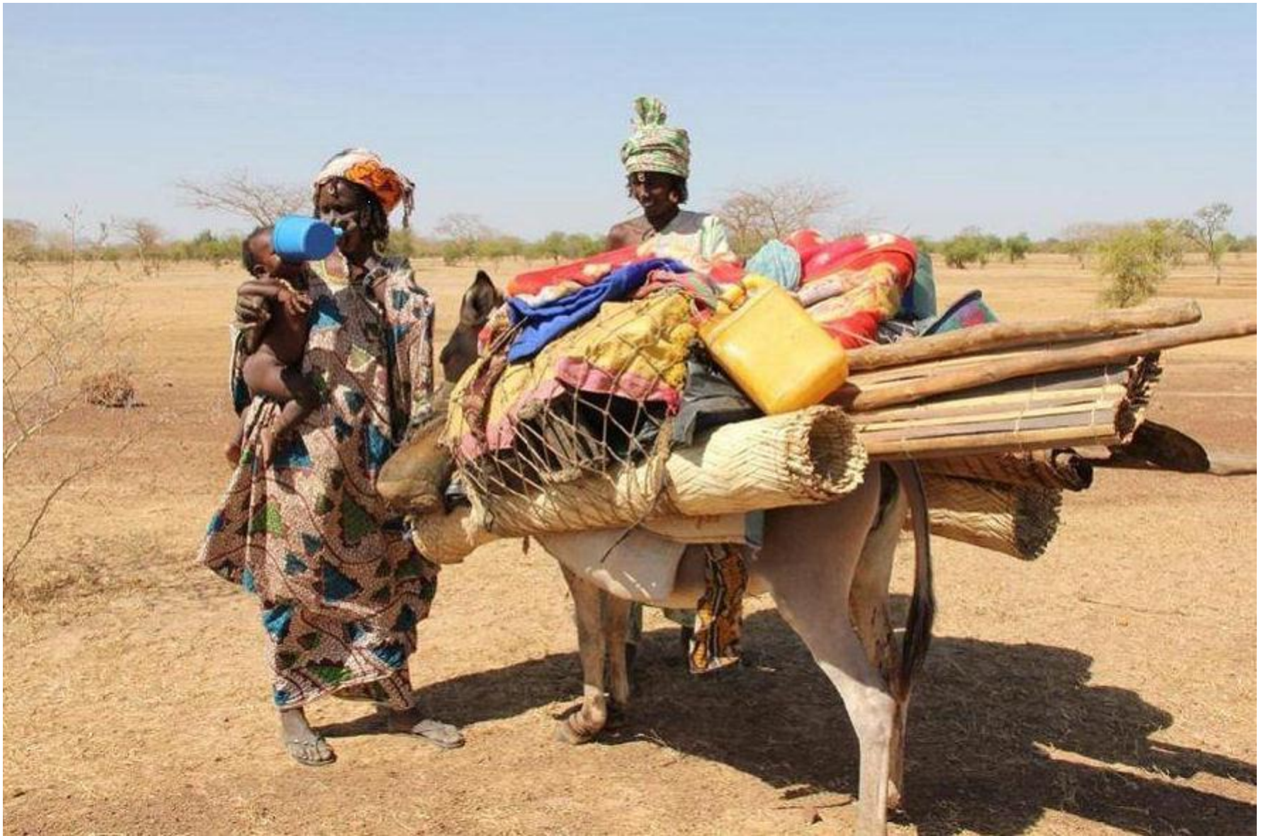
Early migration due to drought (Mali)