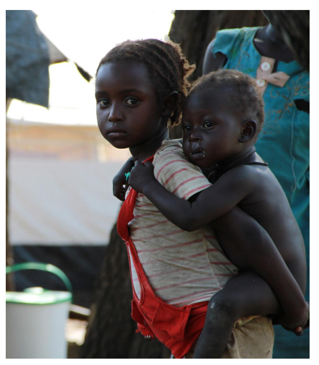
$110 million needed for South Sudan; $78 million for regional refugee response