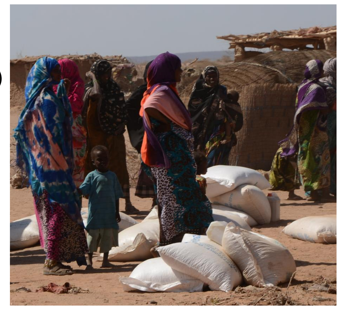
$400 million needed for the first six months of 2016