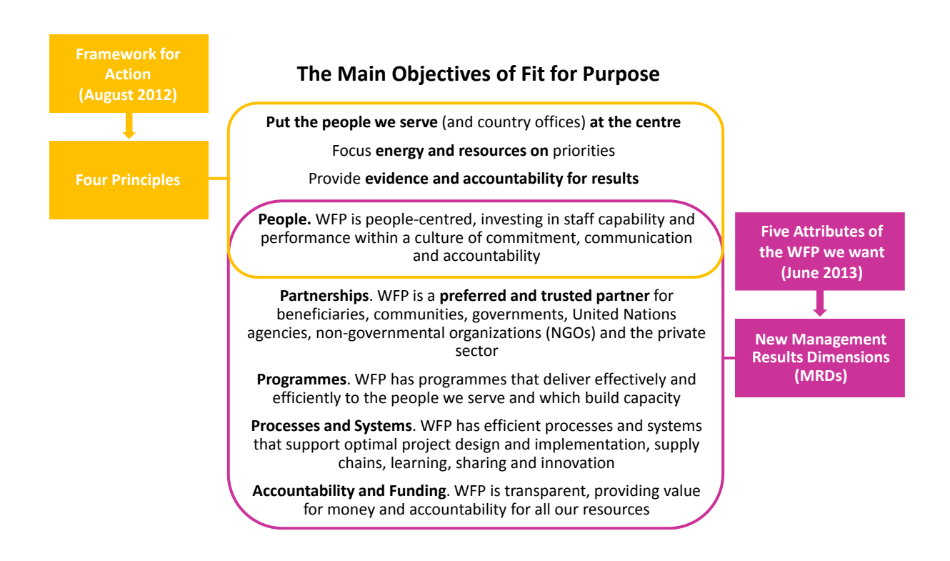
Figure 1: The main objectives of Fit for Purpose