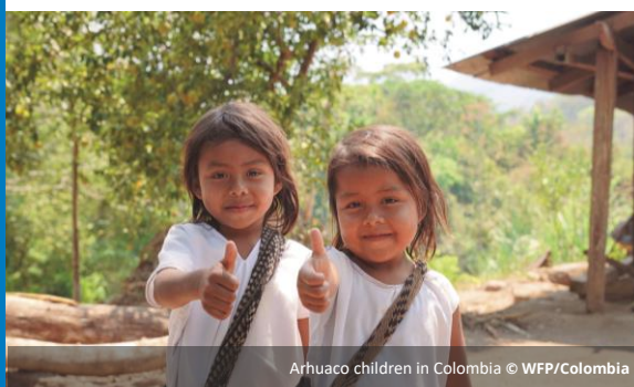
Arhuaco children in Colombia