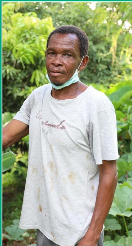
GREEN CLIMATE FUND