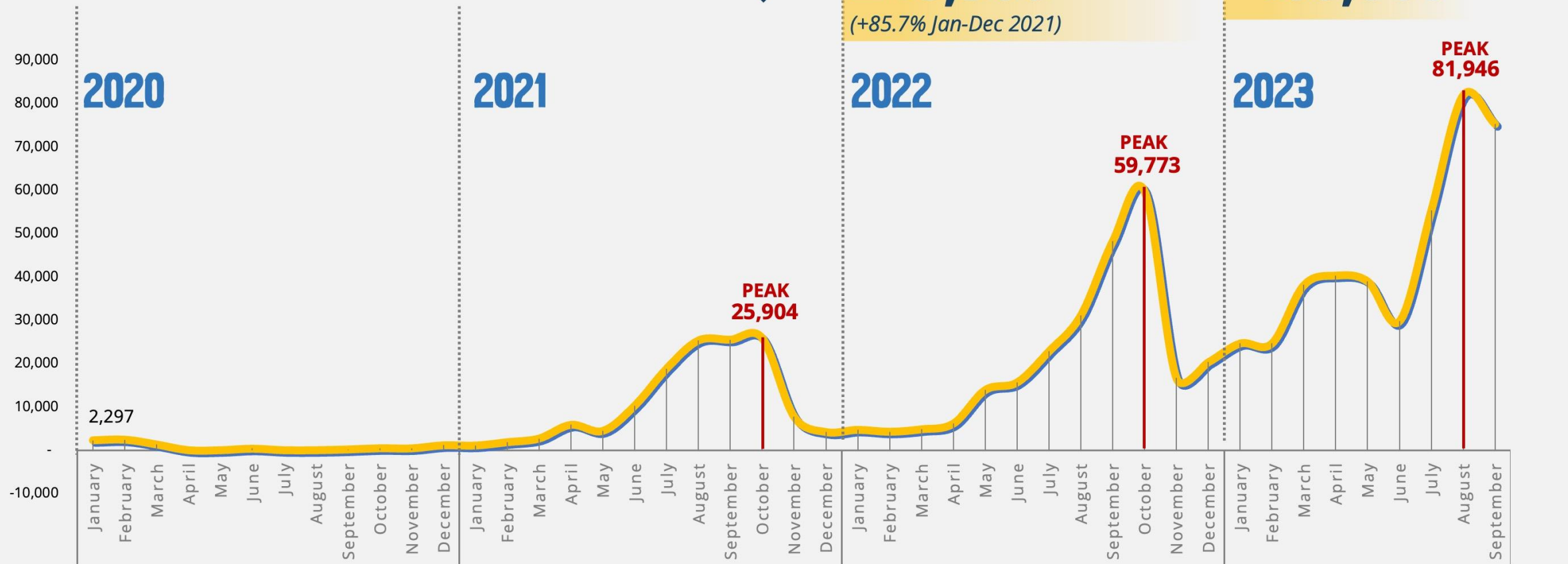
Irregular entries Colombia-Panama border (Darien)