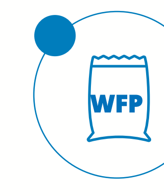
Bag Marking Solution (BMS)