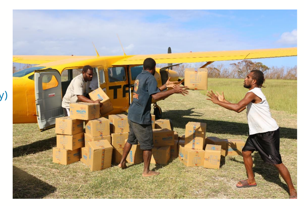
Vanuatu – Tropical Cyclone PAM 2015