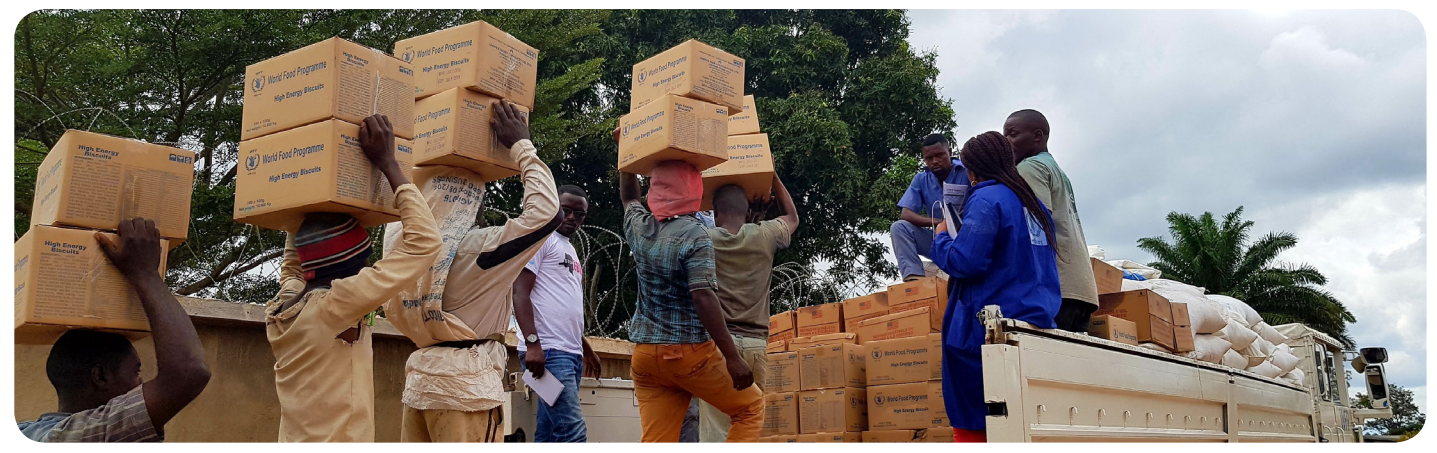
Distribution of high energy biscuits by WFP, Caritas and medical partners in Beni