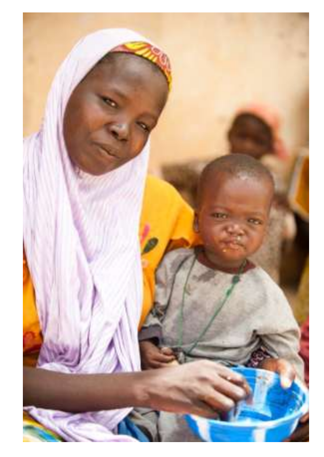
Mother feeding her child at blanket feeding site in Maradi, Niger.