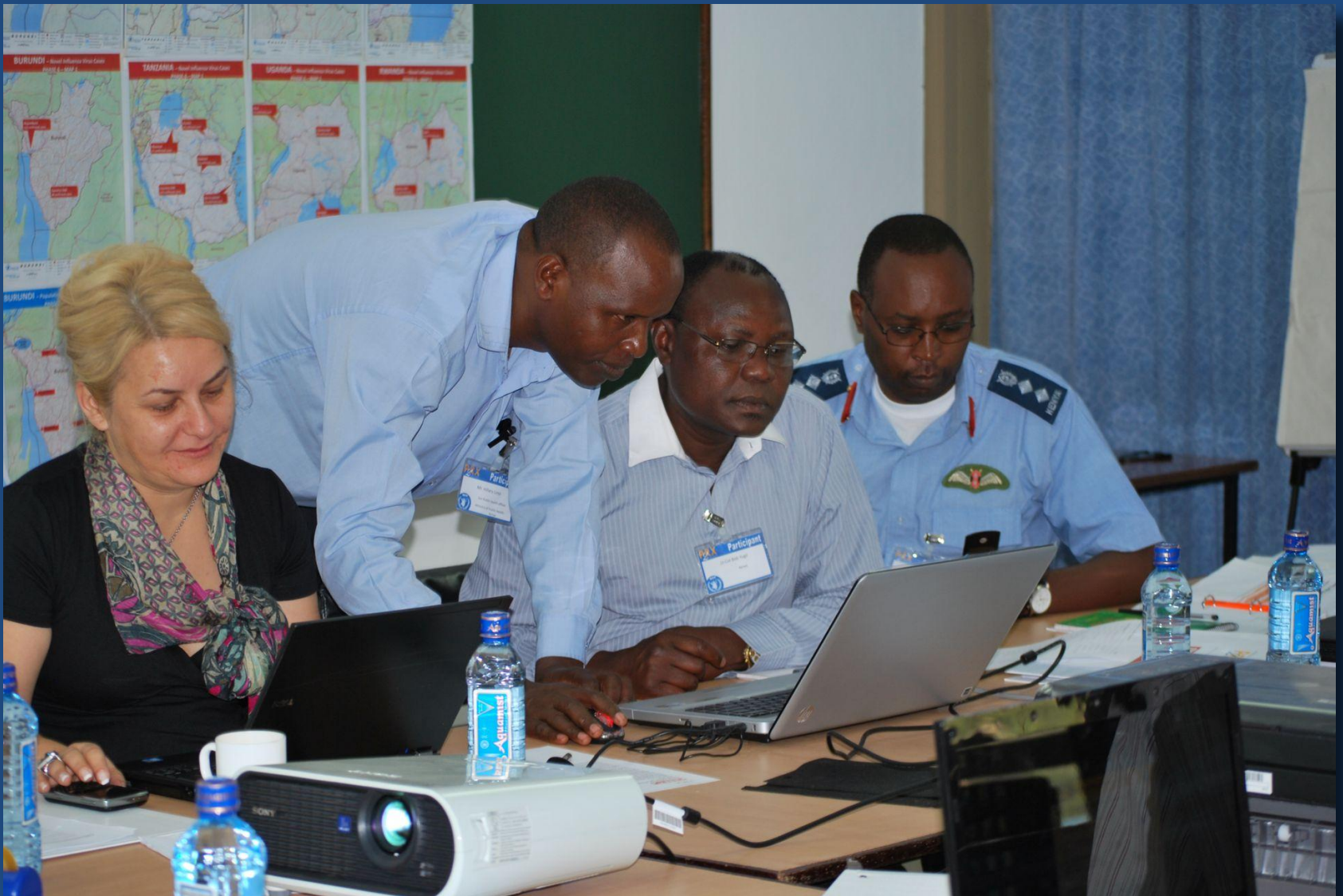
Kenyan NDMA Staff and WFP Logistics Officer stress-testing Regional Supply Chain Management during a Simulation Exercise in Mombasa