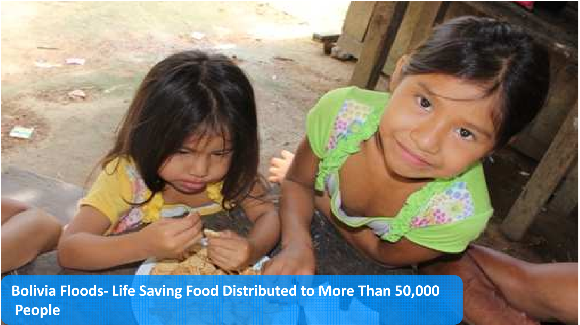
Bolivia Floods- Life Saving Food Distributed to More Than 50,000 People