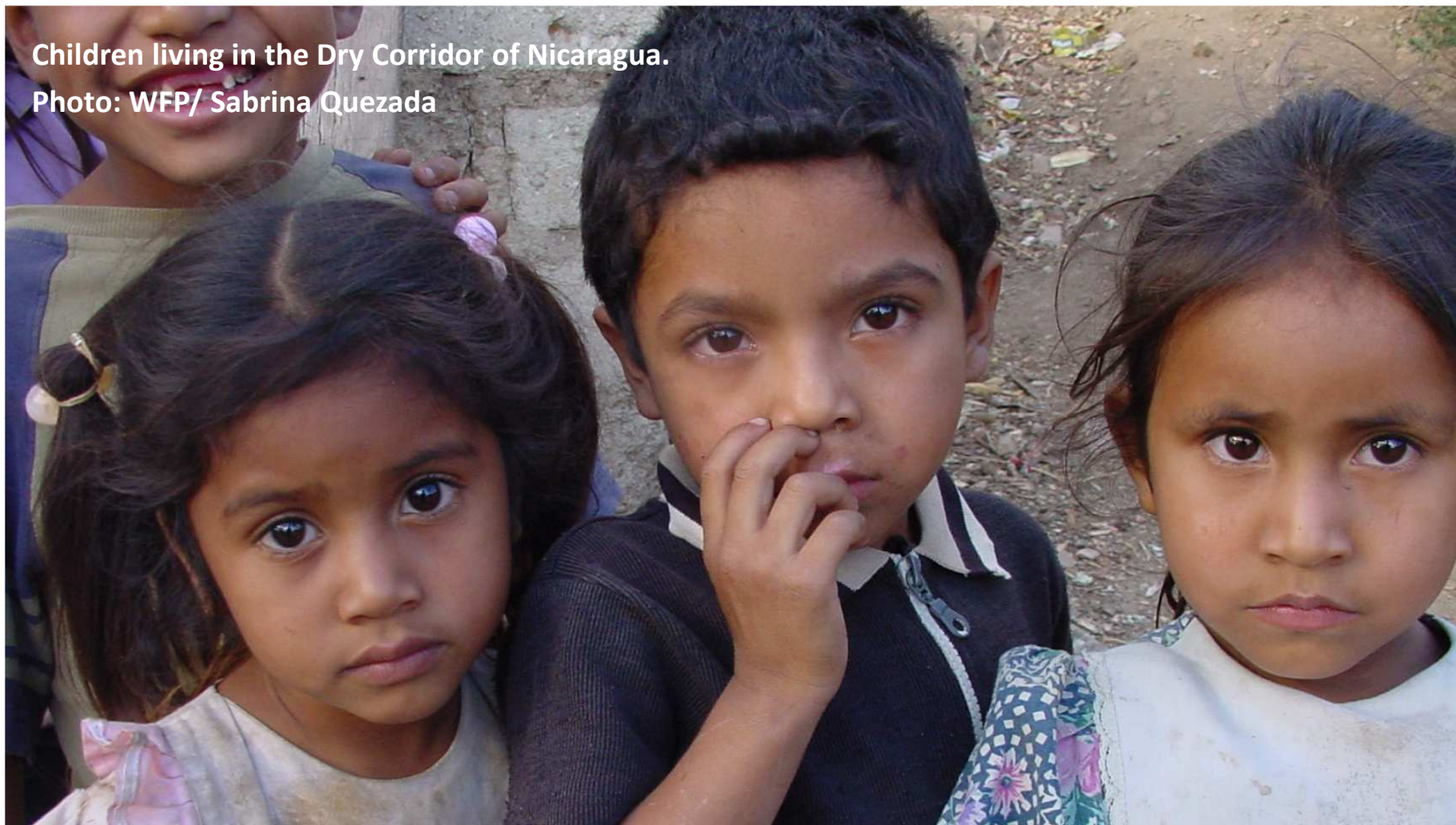
Children living in the Dry Corridor of Nicaragua.