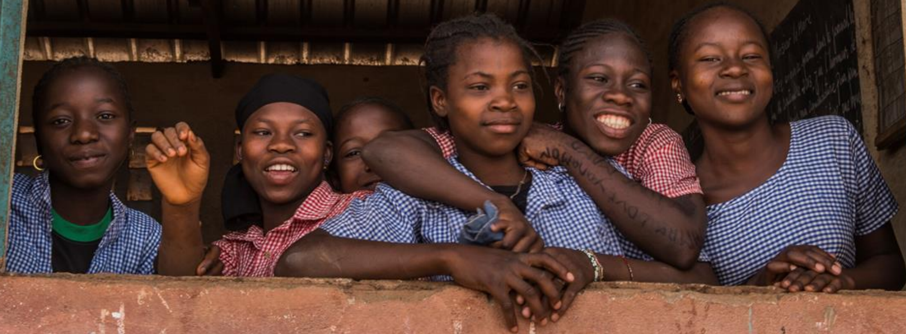
Children return to school - Guinea