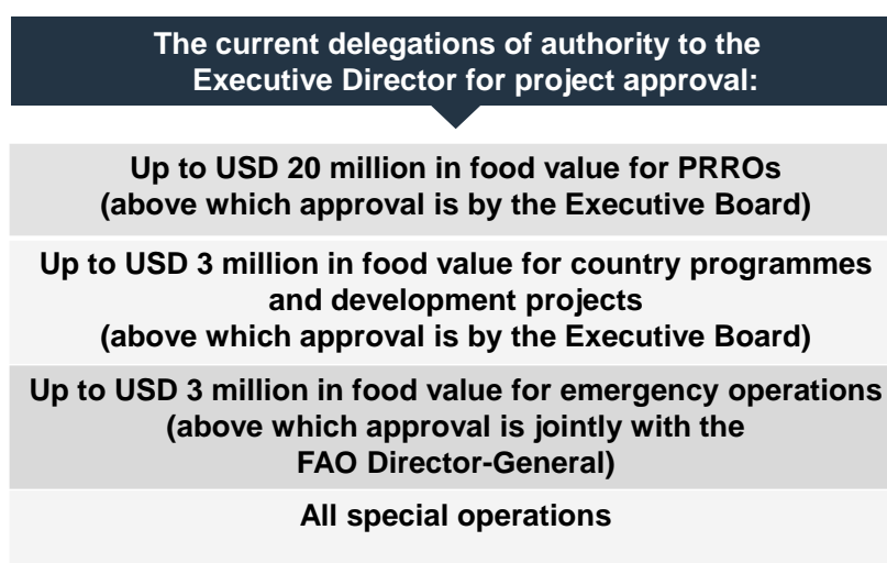
Figure 1: Current delegations of authority to the Executive Director for project approval