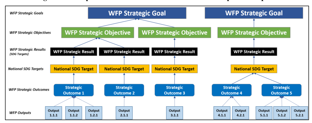
Figure 2: Example of the results chain for a WFP CSP and operational plan

47. Because strategic outcomes reflect the specific situation and dynamics of a country, their wording needs to be appropriate to the national context, resonate with national and subnational actors and show clear alignment with national priorities and goals. Individual strategic outcomes vary from country to country in pitch and formulation, but they all show a clear link to the achievement of a national SDG target, and hence also a WFP Strategic Result. To be truly valuable, strategic outcome statements must be sufficiently consistent with the terminology and policy environment of the specific country to foster consensus among the government and other main stakeholders during the country strategic planning process. Cooperation on the prioritization and framing of results statements also helps to build consensus and joint ownership.