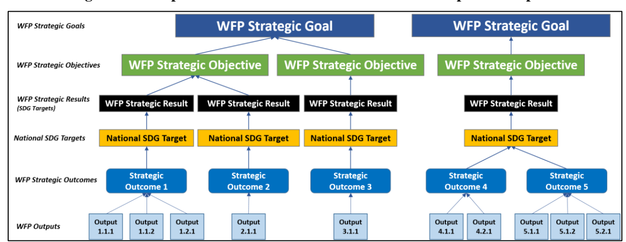
Figure 2: Example of the results chain for a WFP CSP and operational plan

47. Because strategic outcomes reflect the specific situation and dynamics of a country, their wording needs to be appropriate to the national context, resonate with national and subnational actors and show clear alignment with national priorities and goals. Individual strategic outcomes vary from country to country in pitch and formulation, but they all show a clear link to the achievement of a national SDG target, and hence also a WFP Strategic Result. To be truly valuable, strategic outcome statements must be sufficiently consistent with the terminology and policy environment of the specific country to foster consensus among the government and other main stakeholders during the country strategic planning process. Cooperation on the prioritization and framing of results statements also helps to build consensus and joint ownership.