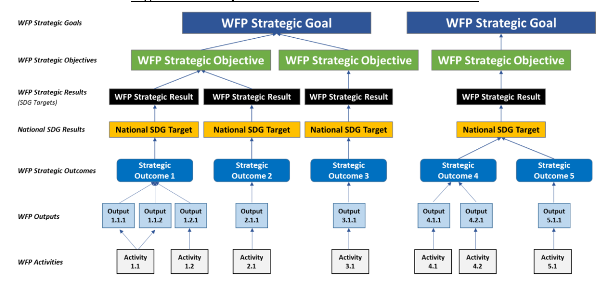
Figure 2: Example of the results chain for a WFP CSP

48.53. A central feature of CSPs is that each strategic outcome is tied to only one higher-level result – a WFP Strategic Result/SDG target or Strategic Objective. To maintain focus and coherence, there should be relatively few strategic outcomes. In cases of ambiguity, a strategic outcome may need to be reformulated or divided into two separate results statements to maintain the identifiable link between cause and effect. Figure 2 provides an example of the results chain of a CSP.