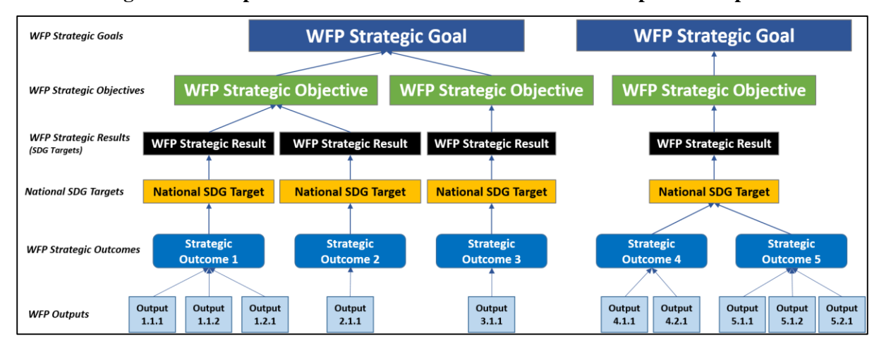
Figure 2: Example of the results chain for a WFP CSP and operational plan