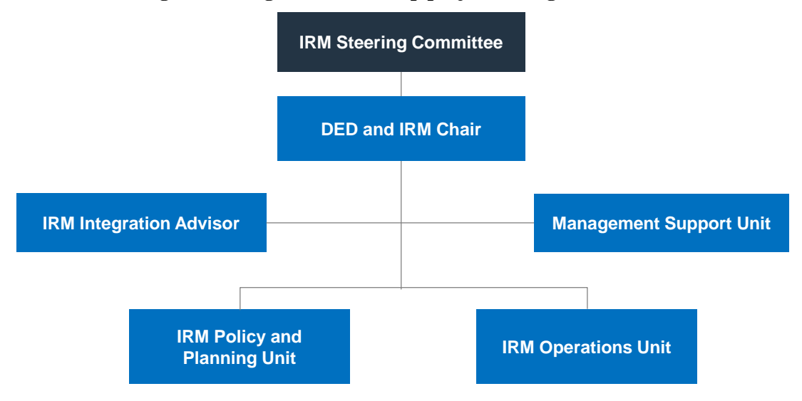
Figure 1: Integrated Road Map project management structure