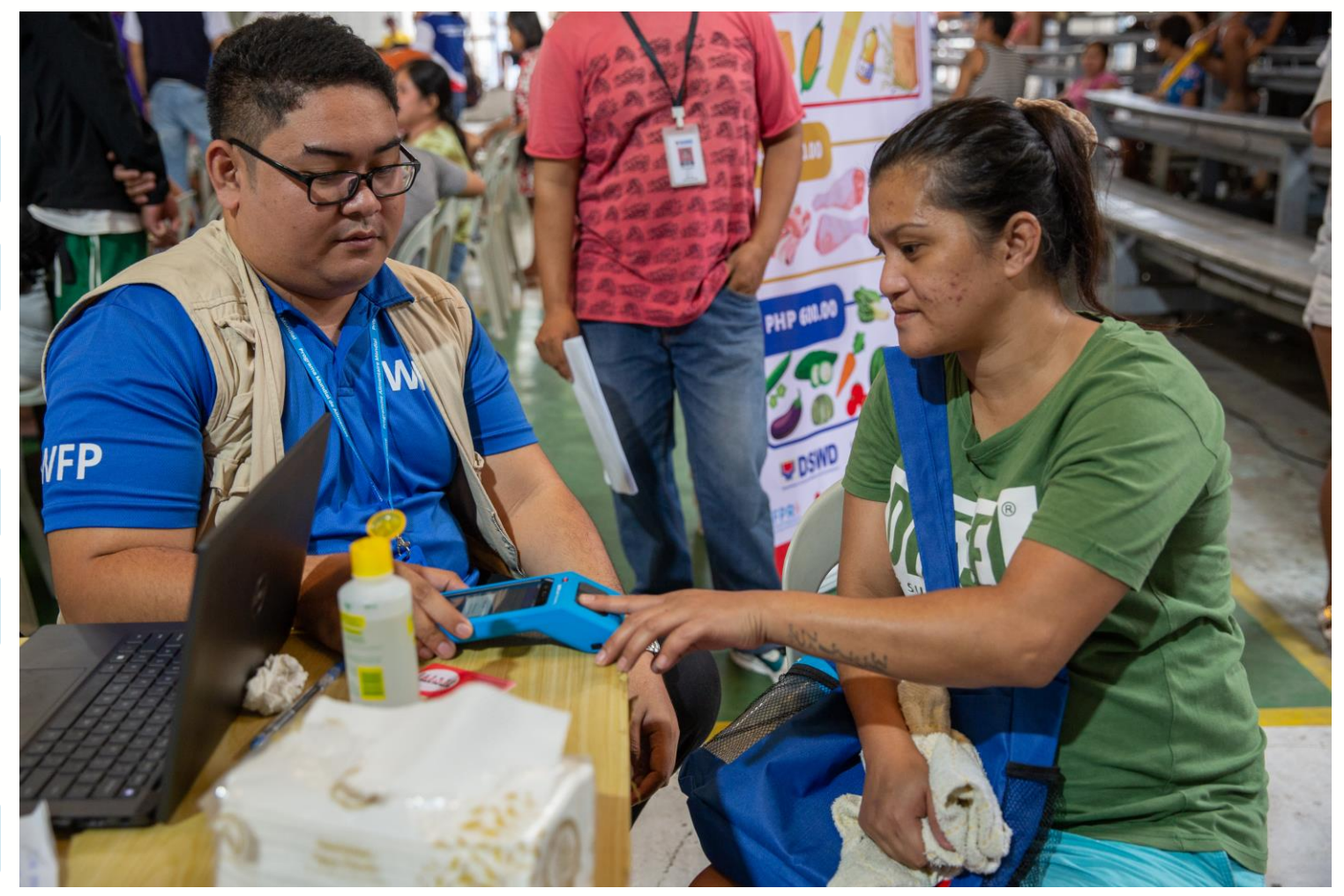
Verification of Walang Gutom (No Hunger) 2027 programme participants in Tondo, Manila on 22 December 2023.