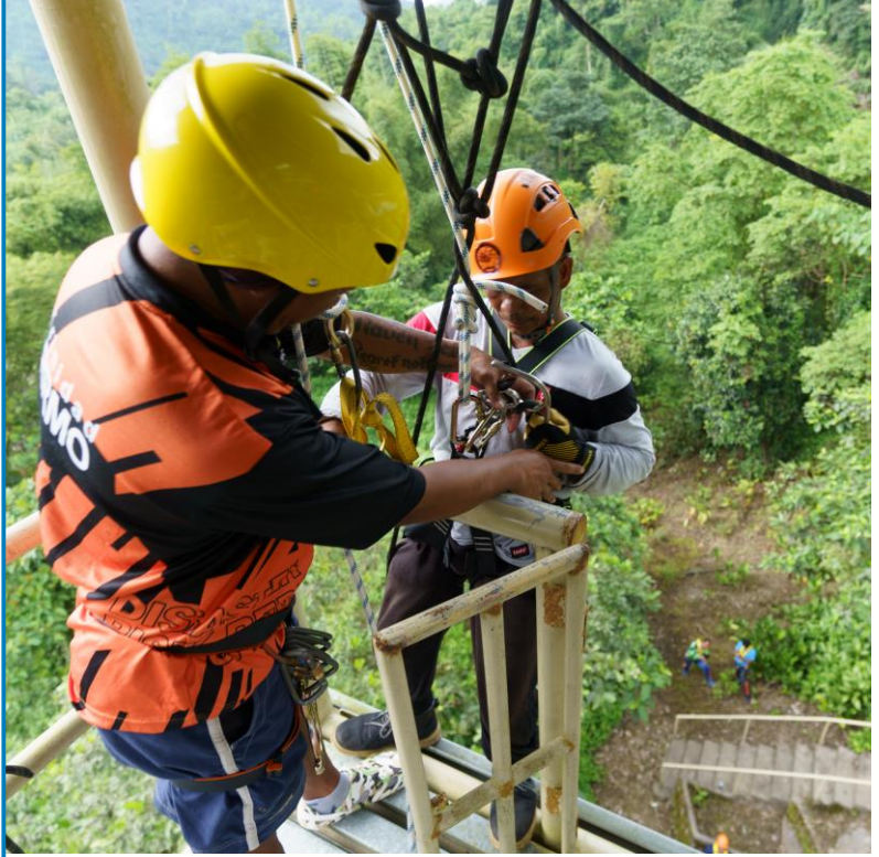
10 December 2023, Atok, Benguet

Preparedness and Response Excellence in the Philippines (PREP) Programme