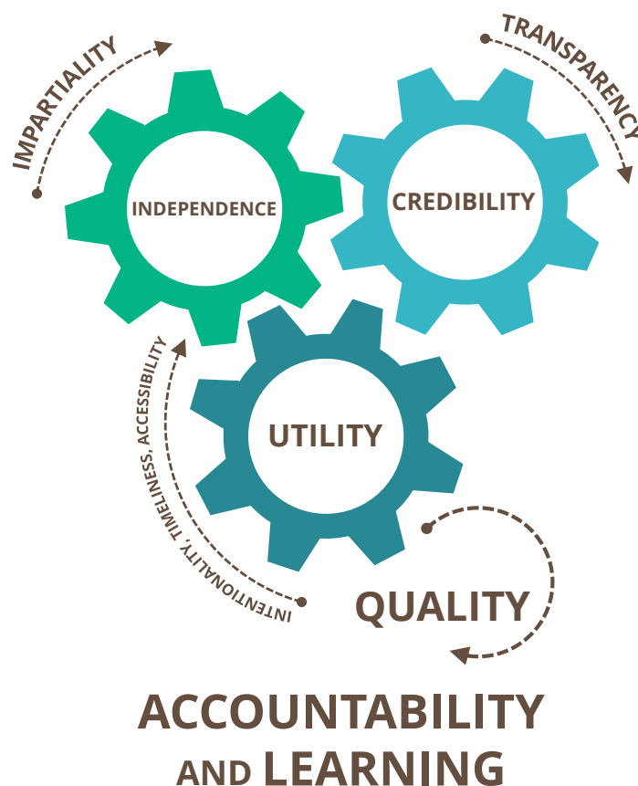
Figure 3 Evaluation principles