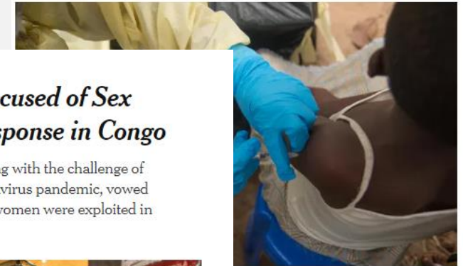
break in the Democratic Republic of the Congo in July.

Women say they were exploited by men who said they were international workers in Democratic Republic of Congo