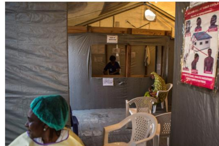
A detection zone for possible Ebola patients at a hospital in Goma, in the eastern part of the Democratic Republic of Congo, in 2019.

The U.N. health agency, already grappling with the challenge of leading the global response to the coronavirus pandemic, vowed it would investigate the allegations that women were exploited in return for jobs.