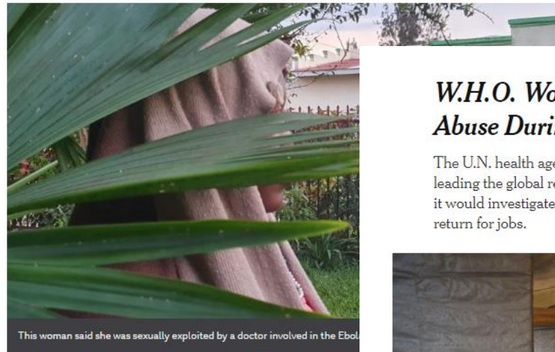
This woman said she was sexually exploited by a doctor involved in the Ebola

The World Health Organization (WHO) has pledged to investigate allegations that aid workers tackling the Ebola outbreak in the Democratic Republic of Congo sexually abused and exploited women.