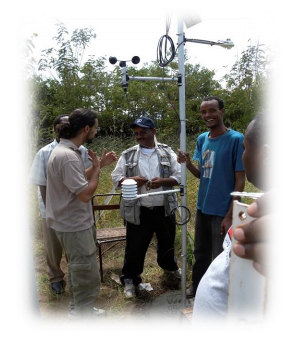
Climate information Services