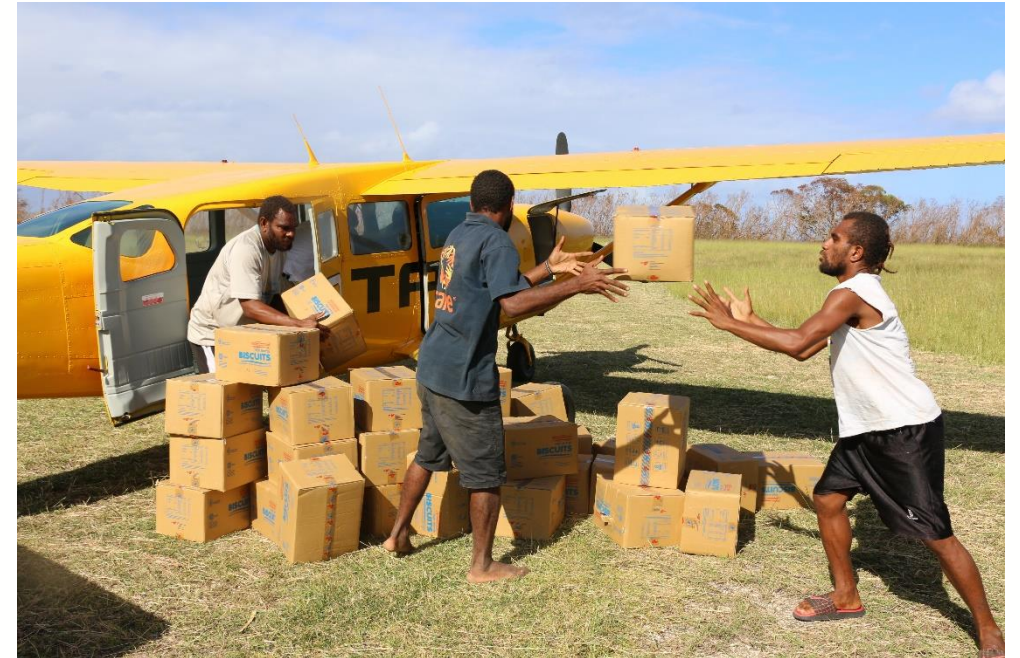
Vanuatu – Tropical Cyclone PAM 2015