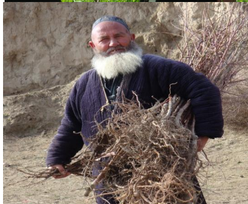
Using tree planting to building sustainable income in disaster prone areas in Tajikistan