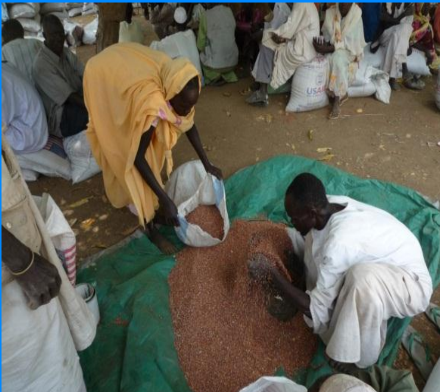
People receiving WFP food during food distribution in Geissan, Blue Nile State