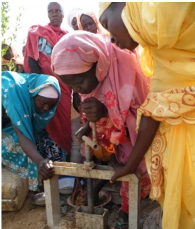
Learning how to make fire briquettes from animal and household waste in Tawila, North Darfur