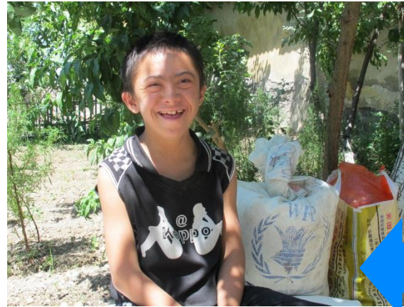
Support to TB patients and their families in Tajikistan