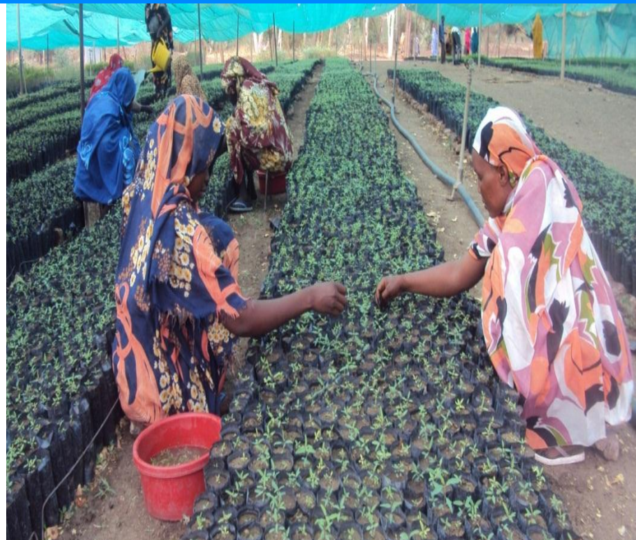
Women planting seedlings during a cash-voucher assisted food for work activity in Kassala, East Sudan

Supporting to 3.6 million beneficiaries in 2013 with a total budget: US$360 million