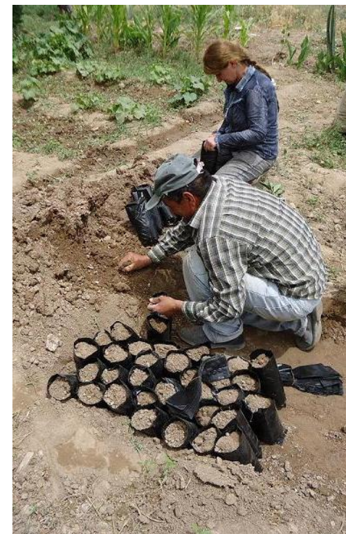
Creation of the vegetable crops in Mosul in Iraq for the returnees

Targeted programmes offer conditional transfers with the Objective of Building Resilience