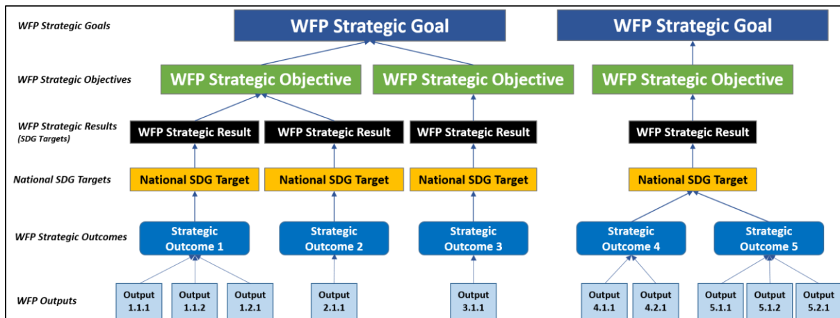
Figure 2: Example of the results chain for a WFP CSP and operational plan