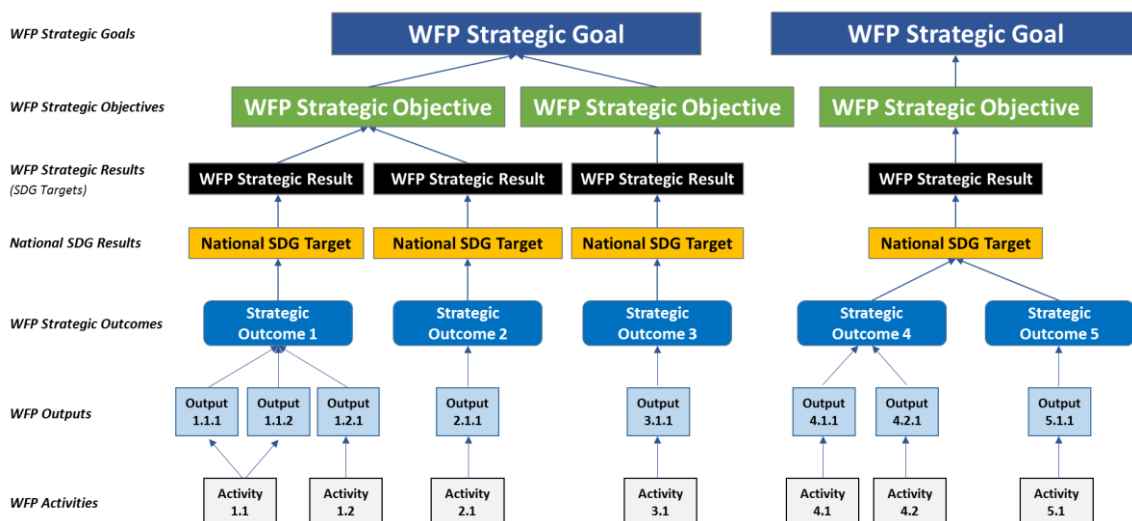
Figure 2: Example of the results chain for a WFP CSP

49.54. The CSP logical frameworks are based on the CRF, which specifies the corporate outcome indicators to be used by all WFP offices for monitoring. WFP country offices retain the flexibility to complement or fill gaps in the CRF with country-specific outcome indicators as required.